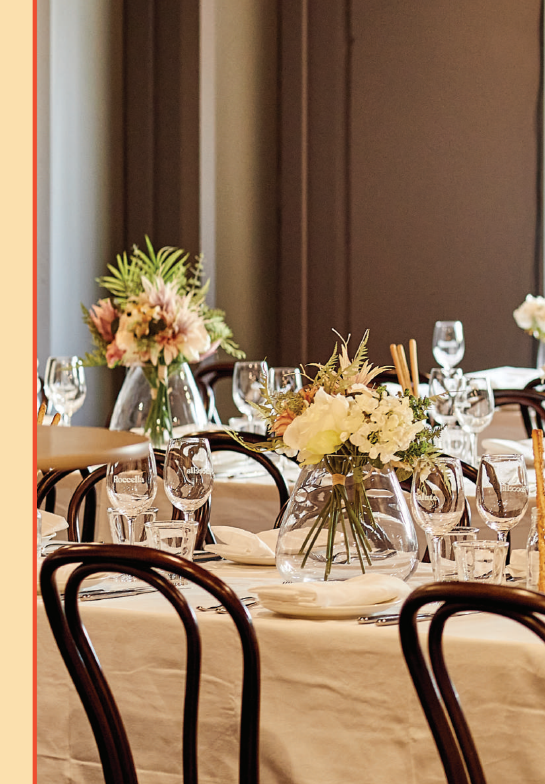
Table cloth or cotton napkin styling ~ $5pp.

Seats up to 80 guests or 120 guests for stand-up, cocktail-style events.